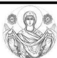
Covenant of Care